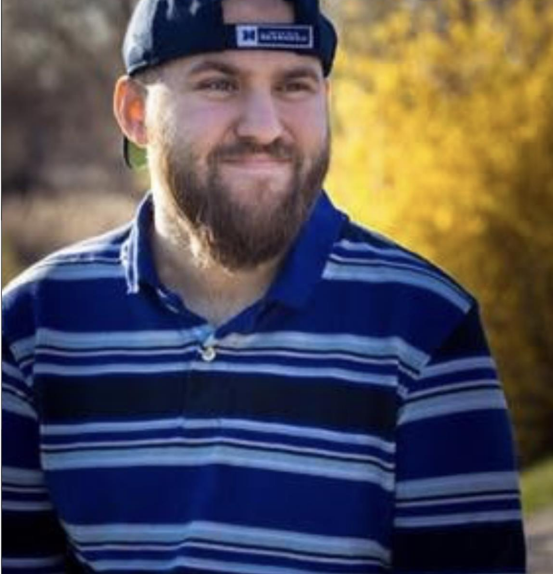
John Lunderville Memorial Foundation

For more information, please click the link here .